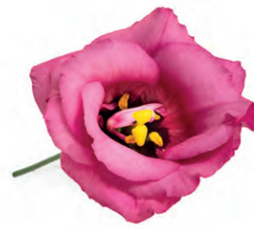
Rosita Hot Pink