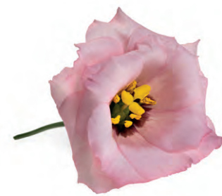
Arena Light Pink