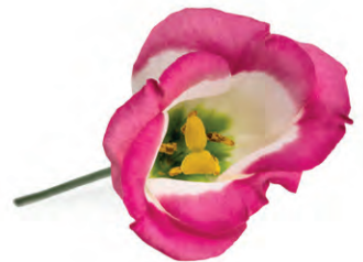
Piccolo Hot Lips