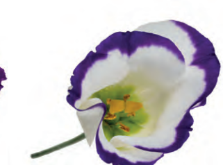
Piccolo Blue Picotee