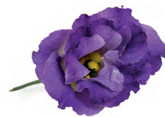
Megalo Blue Flash