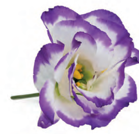
Arena Blue Picotee