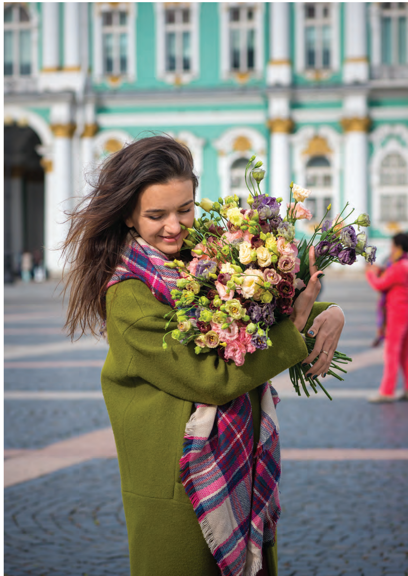
MUSEUM HERMITAGE ST. PETERSBURG • RUSSIA