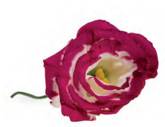
Excalibur Hot Lips