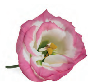
Rosita Hot Lips