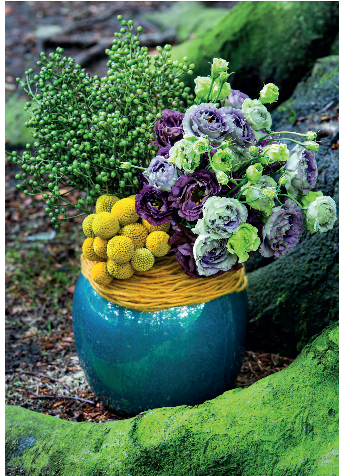
Falling leaves ... falling in love, with Lisianthus.