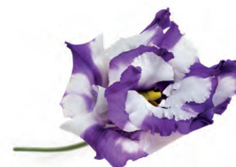
Corelli Delfts Blue