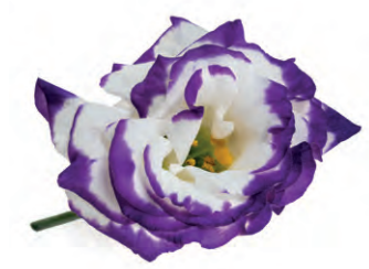
Excalibur Blue Picotee