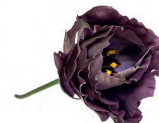
Rosanne Black Pearl