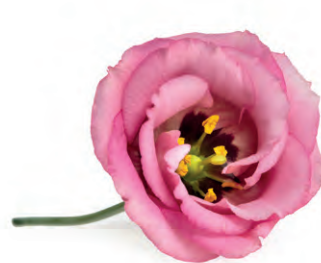
Rosita Rose Pink