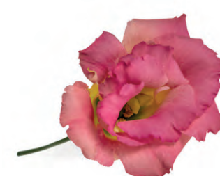
Megalo Light Champagne