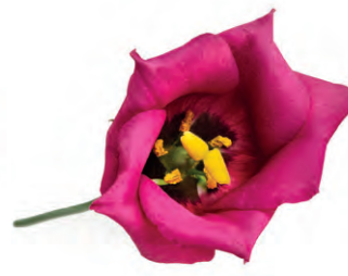
Piccolo Hot Pink