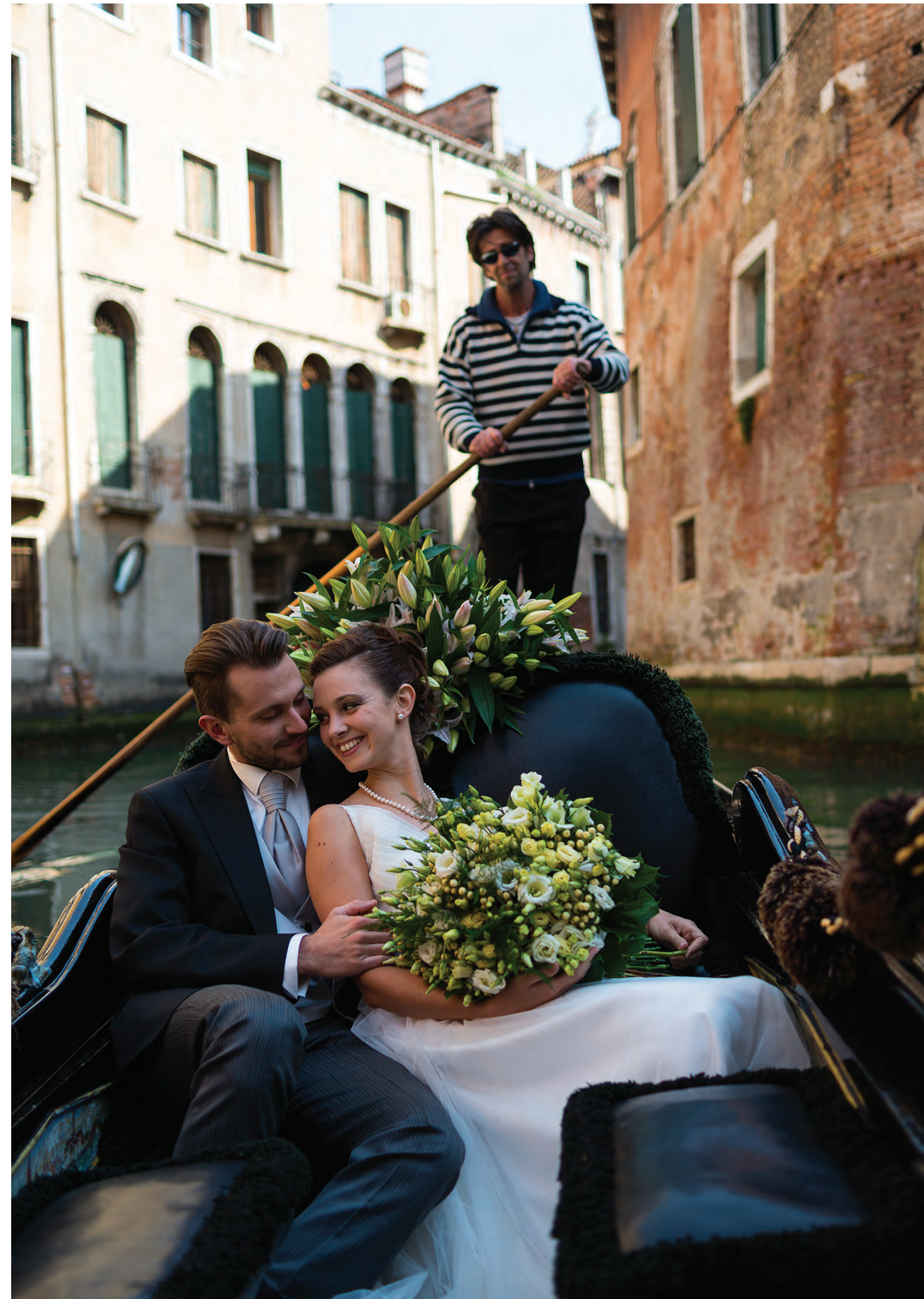
GONDOLA TRIP VENICE • ITALY