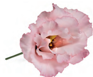
Corelli Light Pink