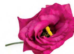
Excalibur Hot Pink