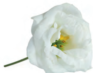
Excalibur Pure White