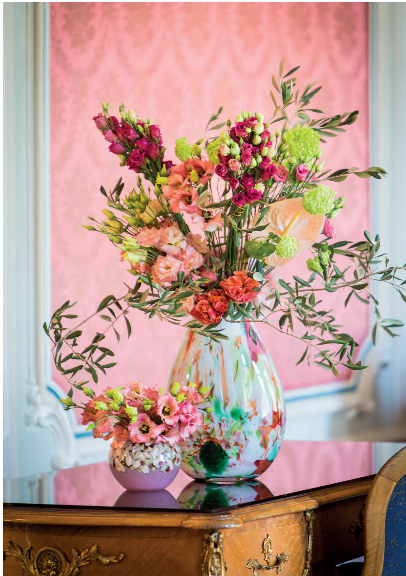
GRAND HOTEL JUNGFRAU VICTORIA INTERLAKEN • SWITZERLAND