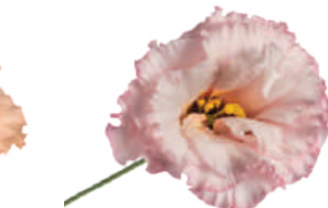
Alissa Light Pink