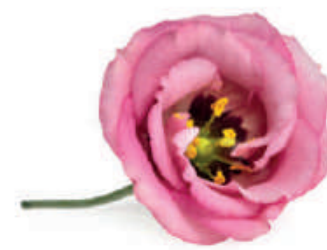
Rosita Rose Pink