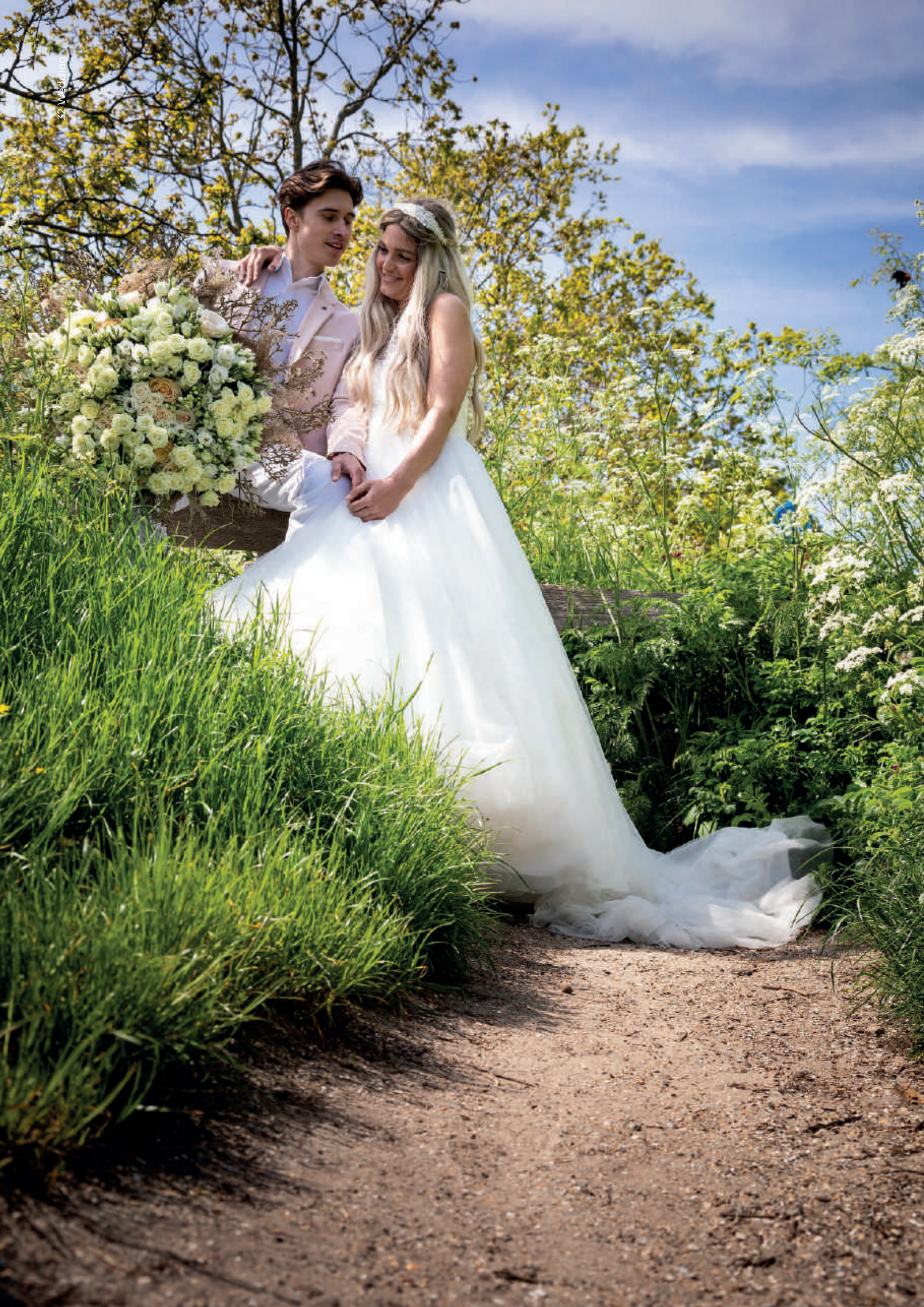
Lisianthus the Wedding flower