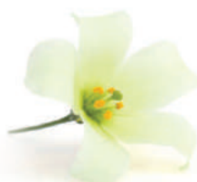
Botanic Green Mist