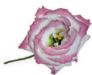
Croma Bridac Kiss