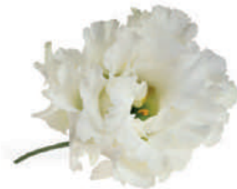
Celeb Chrystal White