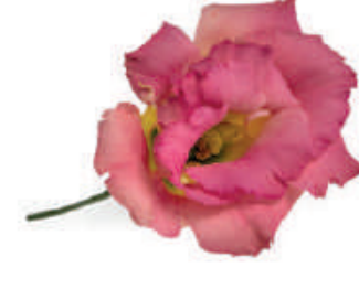
Megalo Light Champagne