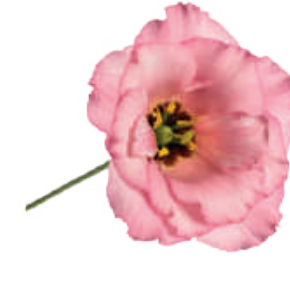
Lisanne Light Pink