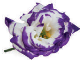
Excaliber Blue Picotee