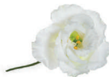
Alissa Pure White