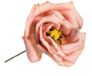
Lisadora Light Apricot