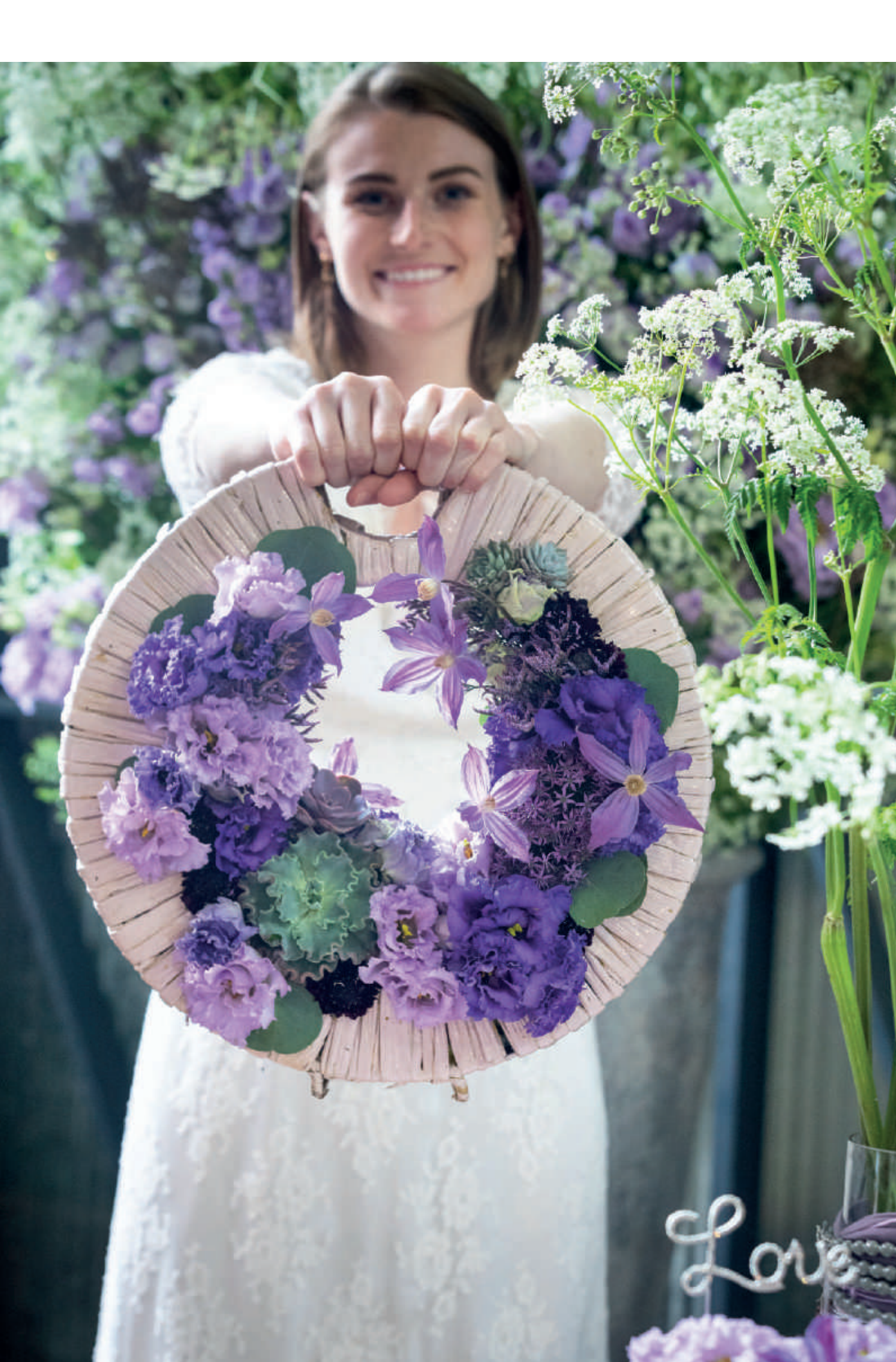
LISIANTHUS THE SPECIAL FLOWER