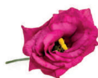
Excalibur Hot Pink