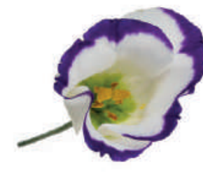
Piccolo Blue Picotee