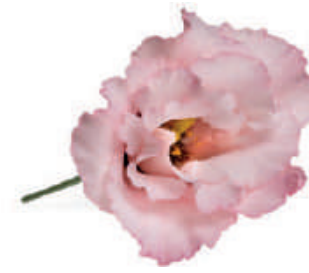
Corelli Light Pink