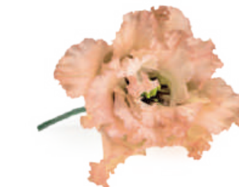
Alissa Light Apricot