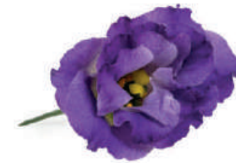
Megalo Blue Flash

For more inspiration, collection availability and downloads of our inspiration pictures visit www.lisianthus.nl