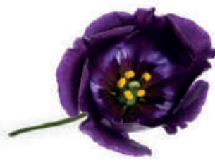
Bohemian Black Violet