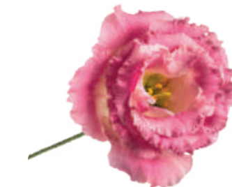
Alissa Pink Flash