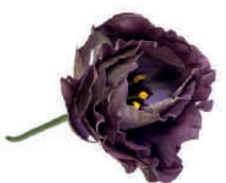
Rosanne Black Pearl