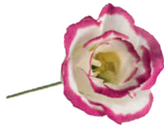
Rosita Pink Picotee