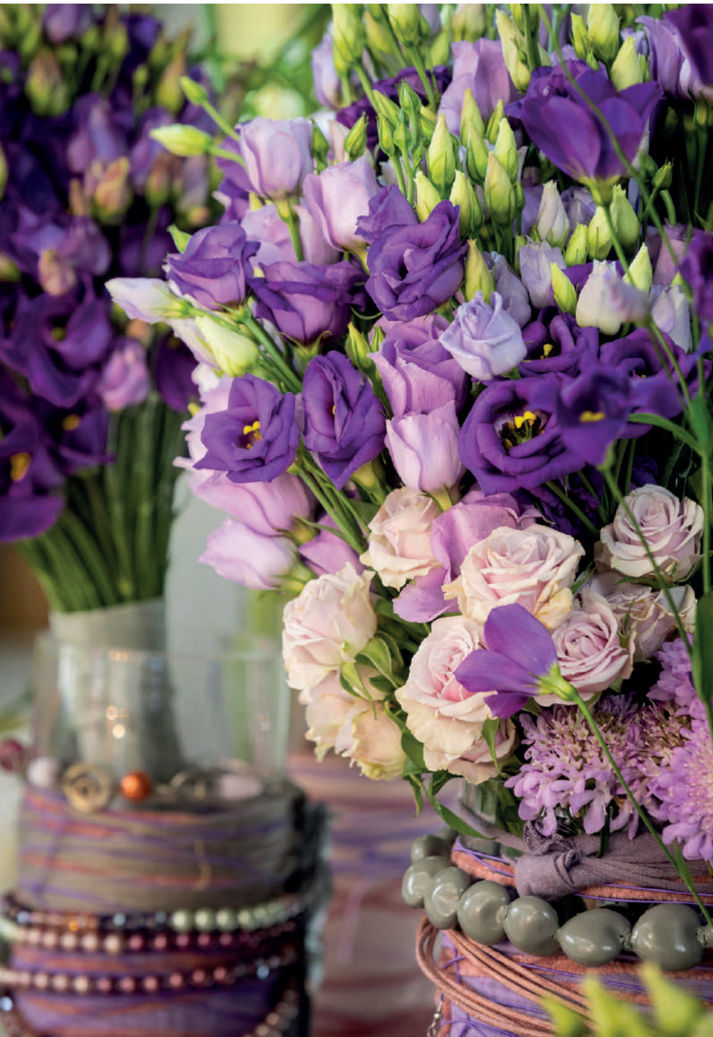
LISIANTHUS THE SPECIAL FLOWER