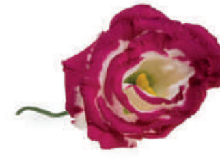
Excalibur Hot Lips