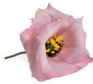
Arena Light Pink